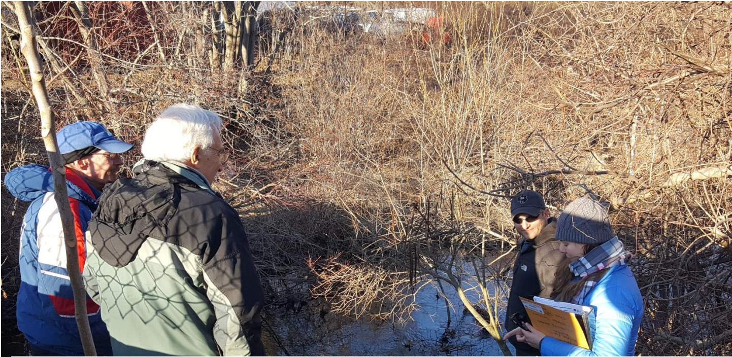
Buckeye Brook Coalition and RIDEM Fish & Wildlife Volunteers' Annual Fish Count in Buckeye Brook