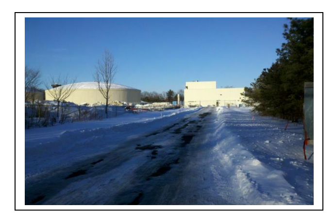
Processing Plant De-Icer Management System